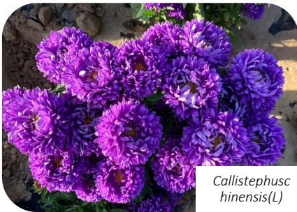
Callistephus chinensis L.