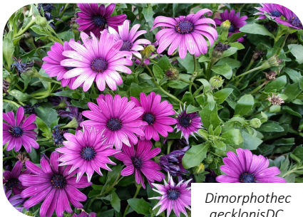
Dimorphotheca aecclionis DC.

We could supply more than 200 varieties annual & biennial plants seeds as well as Perennial flower seeds.