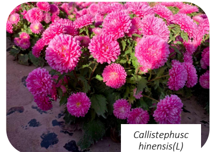
Callistephus chinensis L.